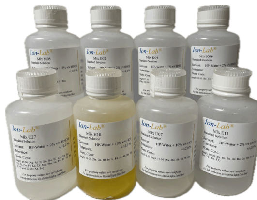
Ion-Lab® Explorer Kit 64 (64 components) EN ISO 17294-2:2024 (Water Quality)